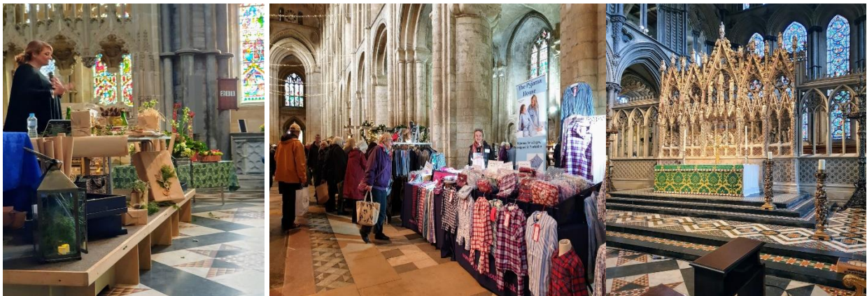
BSWI Ladies visit Ely Cathedral Christmas Food and Craft Fair

Remember that toiletries and personal hygiene items and children's sweets are also well received